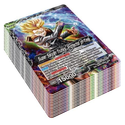
Dragon Ball Super Card Game Demo Deck Set(Series3)

Dragon Ball North America Tour 2018 special web (English): <u>https://www.db-tour.com/</u>