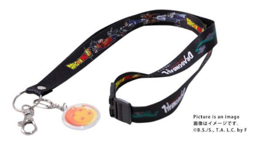
Dragon Ball North America Tour Exclusive Lanyard and Keychain