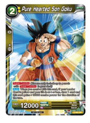
Dragon Ball North America Tour Promotion Card