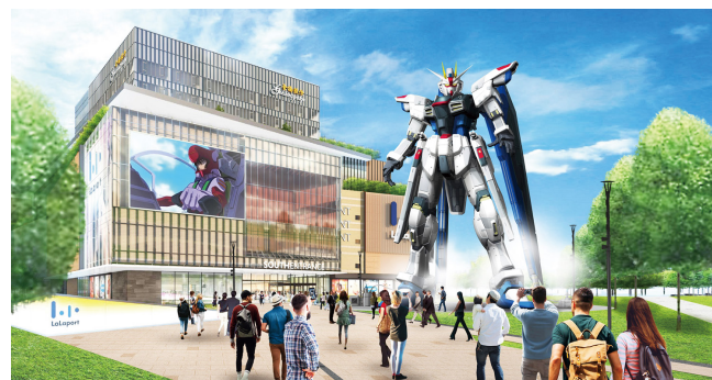
▲ We are planning to install the life-size Freedom Gundam Statue in front of the LaLaport Shanghai Jinqiao in Shanghai, China.