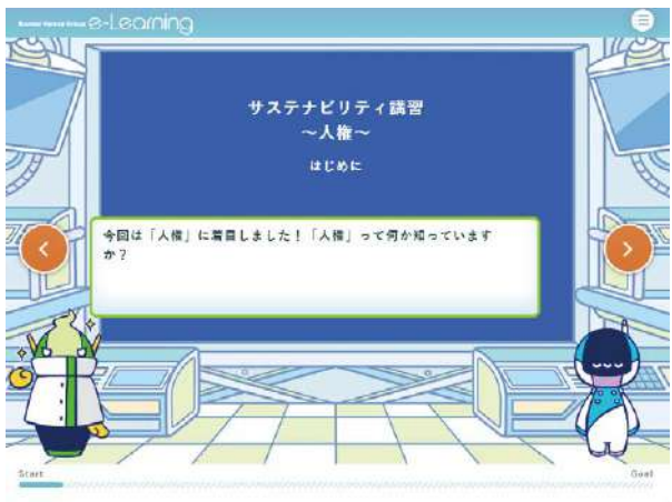
e-learning for employees (available in multiple languages)

Furthermore, believing that promoting executive management's understanding is vital to strengthening human rights measures in the Group, we hold study sessions on human rights for directors of Bandai Namco Holdings. We also hold seminars and e-learning for employees on topics such as sustainability, work-life balance, the LGBTQ community, and disabilities to raise awareness of human rights and foster a culture of sustainability within the Group.