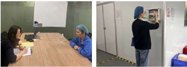
Bandai Factory Audits

To inform and disseminate the Group's philosophy and approach to human rights among employees, including Group officers, we conduct awareness-raising activities as appropriate.